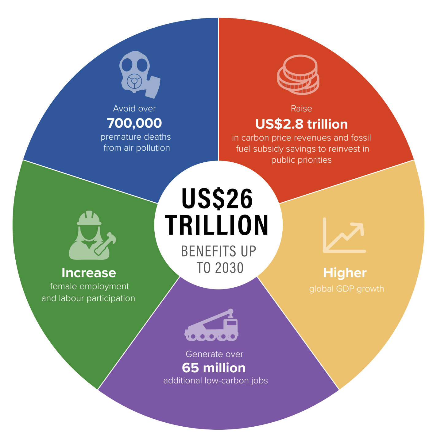
Figure A The Global Benefits of a Decisive Shift to a Low-carbon Economy when Compared with Business-as-usual.

Note : The results cited for the US$26 trillion in direct economic benefits are cumulative for the 2018-2030 period, whereas the other data points reported are for the year 2030.